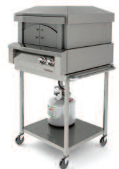
Pizza Basic Cart