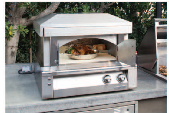
Countertop Pizza Oven Plus