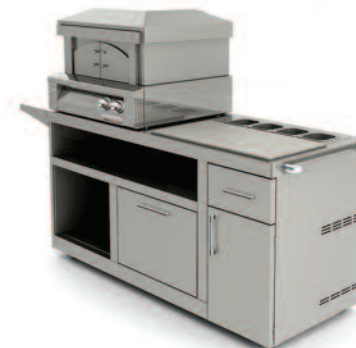
Pizza Prep Cart